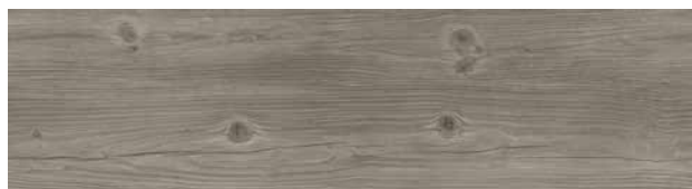
A002-06 Natural Woodgrains - Winter Grey