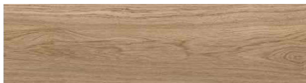
A002-07 Natural Woodgrains - Washed Wheat