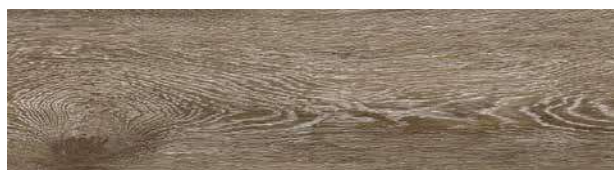
A004-05 Textured Woodgrains - Grey Dune