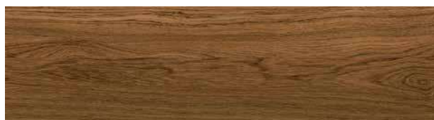
A002-04 Natural Woodgrains - Beech