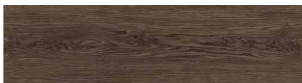
A002-05 Natural Woodgrains - Storm