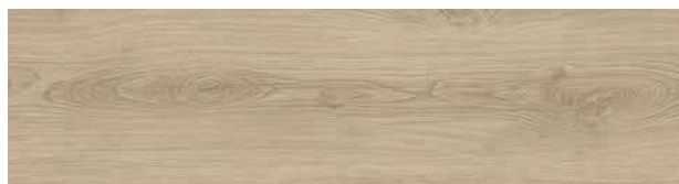
A002-08 Natural Woodgrains - Sand Dune