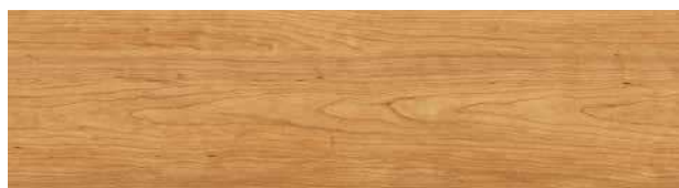
A002-12 Natural Woodgrains - Cedar