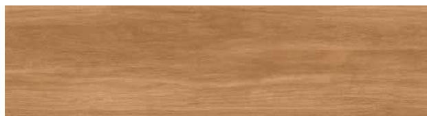
A002-11 Natural Woodgrains - Washed Maple