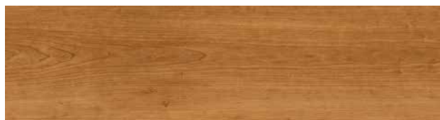
A002-10 Natural Woodgrains - Teak