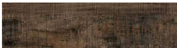
A004-04 Textured Woodgrains - Distressed Black Walnut