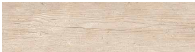
A004-07 Textured Woodgrains - White Wash