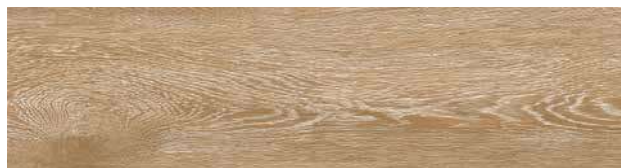
A004-06 Textured Woodgrains - Antique Light Oak