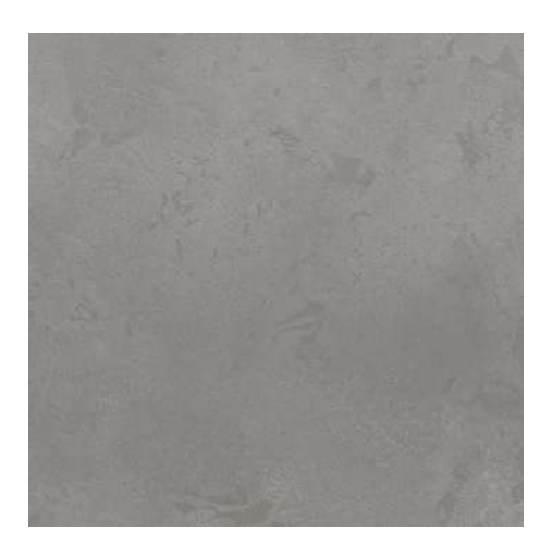
B00201 DOVE B00202 IRON